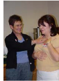
Breathing techniques are one of many self-management techniques taught during CDSMP training.

The Diabetes Prevention Initiative staff at SoAHEC, coordinates master and lead train-the-trainer events, and community trainings in Doña Ana and Otero counties. Each training is conducted by two lead trainers with each training session providing highly participatory activities, where mutual support and success builds the participants' confidence in his or her ability to manage their health and maintain active and fulfilling lives.